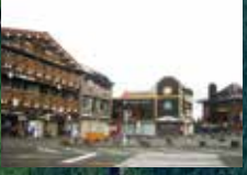
Fuji Subaru Line 5th Sta